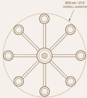
TOP VIEW SCALE 1:5